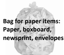
Bag for paper items: Paper, boxboard, newsprint, envelopes

Paper items and recyclable containers go in separate bags: paper items are processed separately from recyclable containers. Do not mix paper and containers together in the same bag—they could be rejected.