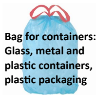
Bag for containers: Glass, metal and plastic containers, plastic packaging